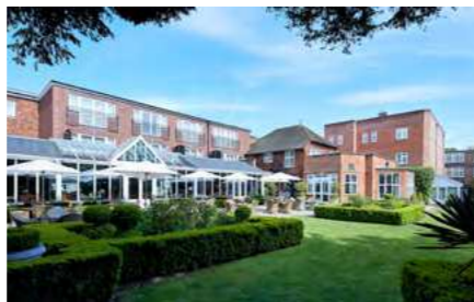
The Bull Gerrards Cross | Buckinghamshire • 147 bedrooms • 13 meeting and event suites • Capacity for up to 180 delegates • Beeches Restaurant • Jack Shrimpton Bar • Conservatory Lounge Bar • Landscaped gardens • Free on-site car parking • Free WiFi throughout