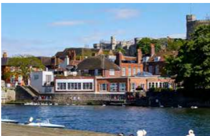
Sir Christopher Wren Hotel and Spa Windsor | Berkshire • 138 bedrooms • 3 meeting and event suites • Purpose-built business centre • Capacity for up to 110 delegates • The Brasserie at Sir Christopher Wren • Riverside terrace • Limited on-site car parking • Wren's Club beauty and fitness • Free WiFi throughout

Each hotel has traditional architecture combined with modern facilities, state-of-the-art conference venues, comfortable bedrooms, award-winning dining options and all the mod cons for today's business traveller.