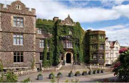
The Abbey Great Malvern | Worcestershire • 103 bedrooms • 7 meeting and event suites • Capacity for up to 300 delegates • PrioryView Restaurant • PrioryView Bar • Landscaped gardens • Free on-site car parking • Free WiFi throughout

Sarova Hotels is a family owned hotel company with over 40 years experience in the hospitality industry. At Sarova Hotels you will find 4-star hotel and conference venues with unique character and architecture, all located in pivotal locations in the UK.