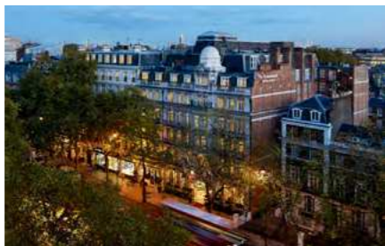
The Rembrandt Knightsbridge | London • 194 bedrooms • 6 meeting and event suites • Boardroom for small meetings • Capacity for up to 200 delegates • Palette Restaurant • 1606 Lounge Bar • Aquilla Health & Fitness club • Free WiFi throughout